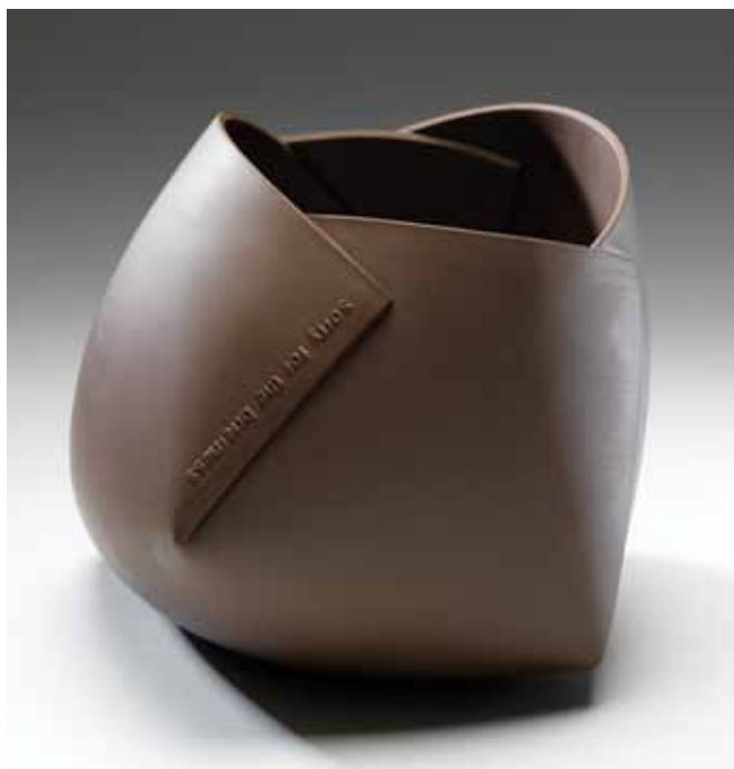
Above: Vessel, 10 in. (25 cm) in length, slab-built and press-molded dark earthenware, fired in an electric kiln to 2012°F (1100°C), 2012.

The simplicity and clarity of Van Hoey's work—both in process and in the finished, seemingly weightless forms—are the equivalent to a whisper with the authority of a shout. The incisions and folded walls create unexpected but precise shapes that are quiet and unassuming while maintaining a sense of energy and movement. Their bold, saturated colors are the perfect compliment to a delicate structure.