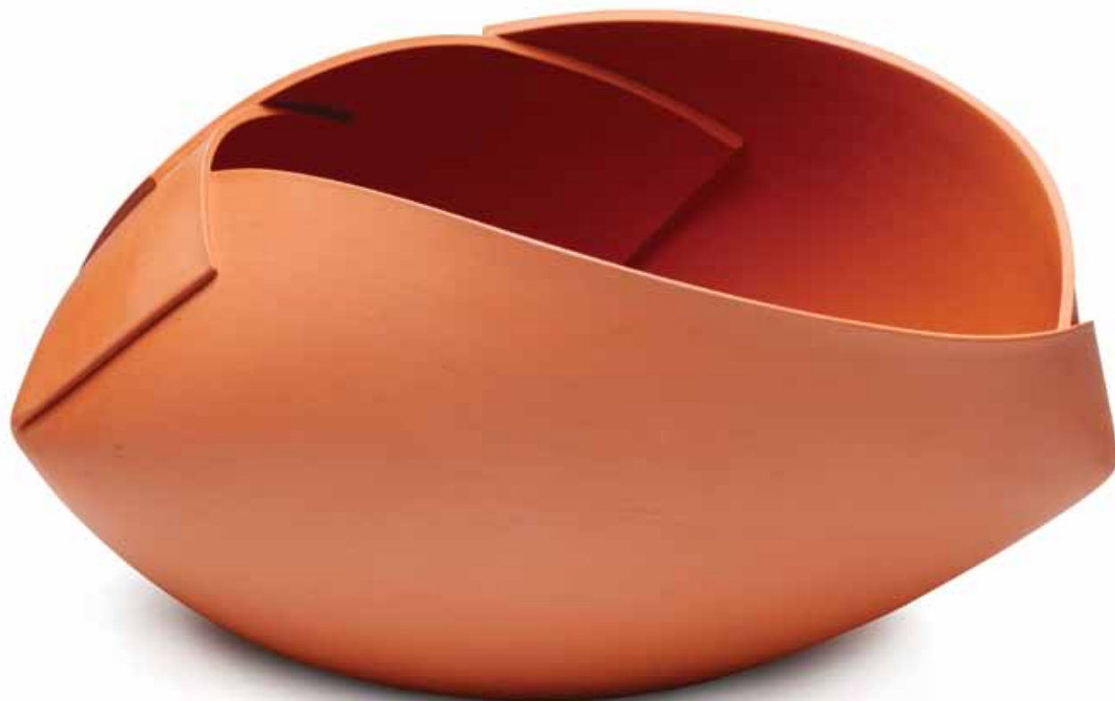
Below: Vessel, 14 in. (36 cm) in length, slab-built and press-molded red earthenware, fired in an electric kiln to 2012°F (1100°C), 2012.